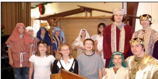
Trinity campus students presented the Christmas musical I Witness News: Live from Bethlehem

Give your child the gift of a Christian education.