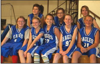
The two basketball teams pose after a recent game. After a hiatus from intermural competition, it is good to be back on the courts.