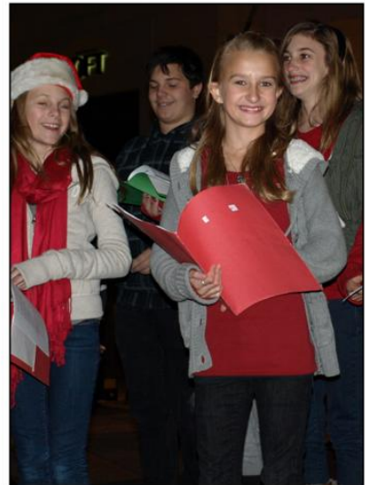
Middle school choir students sang at the Simi Valley Town Center in December

Students in kindergarten through grade three presented this year's Christmas musical Shepherds, Sheep, and a Savior last month at the Shepherd of the Valley campus.