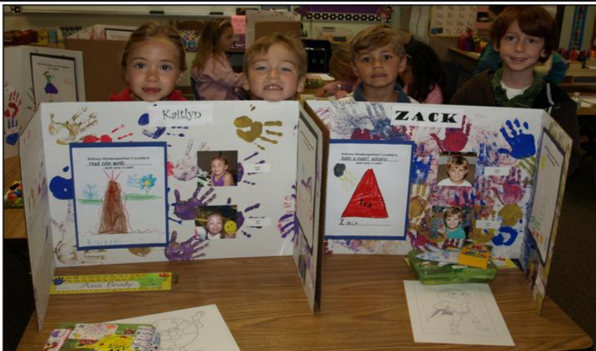
Kindergarten students stand behind some of the displays they made for Success Night on Wednesday, April 21. This evening was a celebration of the growth made by each student during the 2009-2010 school year.