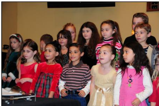
Students in grades K-3 sing at the Hanging of the Greens Advent worship service at Trinity.