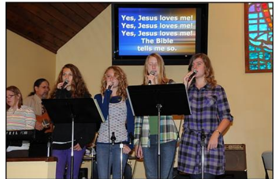
Students in grades 6-8 lead worship services as part of the student worship band team.