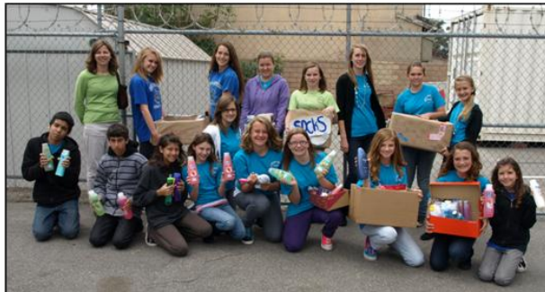
Leadership students deliver hair care products to Care and Share as part of a school service project.