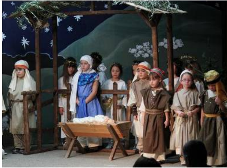
Oh, for the faith of a young child . . . Good Shepherd students re-enact the nativity during their Christmas musical Star of Wonder presented on December 9.